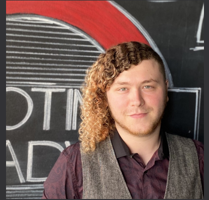
ACTING VICE PRESIDENT