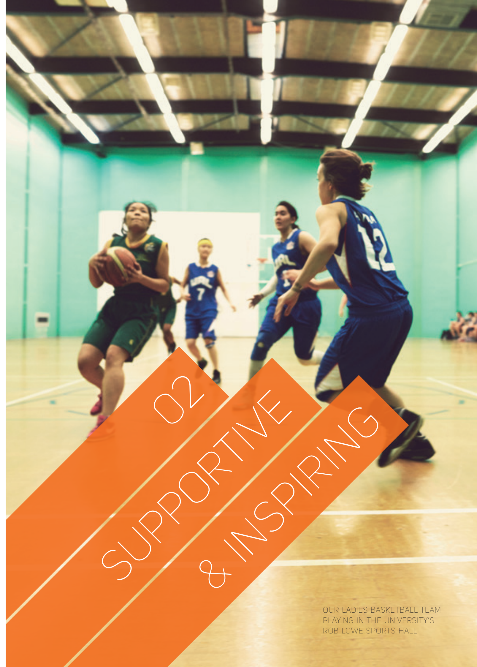
OUR LADIES BASKETBALL TEAM PLAYING IN THE UNIVERSITY'S ROB LOWE SPORTS HALL

Celebrating our successes – we are proud of our members, and want the great achievements of our students, clubs and societies to be commended and celebrated