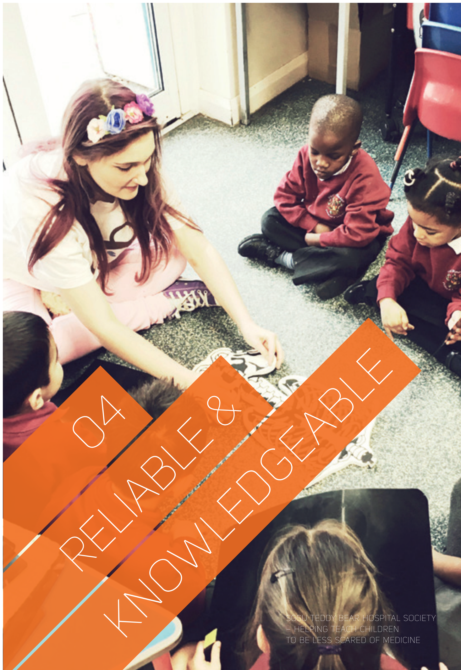
SGSU TEDDY BEAR HOSPITAL SOCIETY – HELPING TEACH CHILDREN TO BE LESS SCARED OF MEDICINE